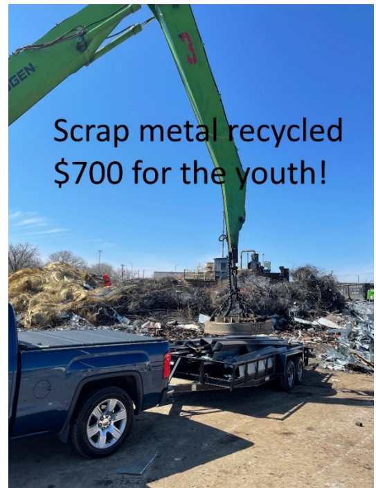
Scrap metal recycled $700 for the youth!