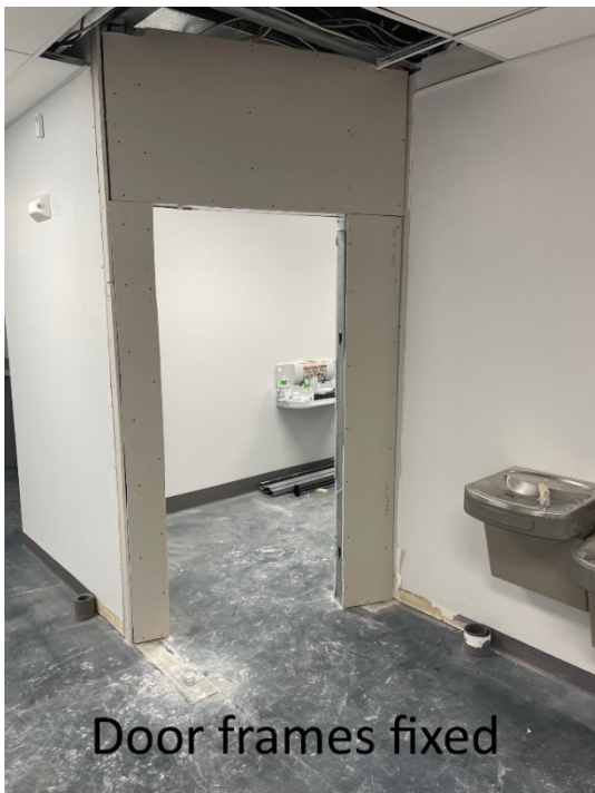
Door frames fixed