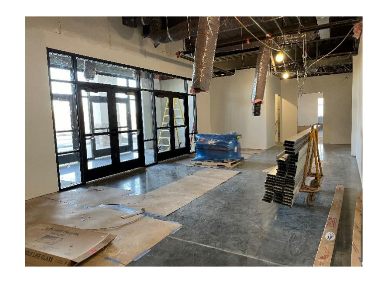
CONSTRUCTION CONTINUES - BUILDING DEDICATION SET FOR JANUARY 23, 2022