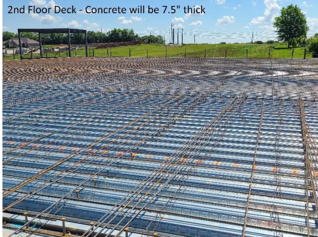
2nd Floor Deck - Concrete will be 7.5" thick