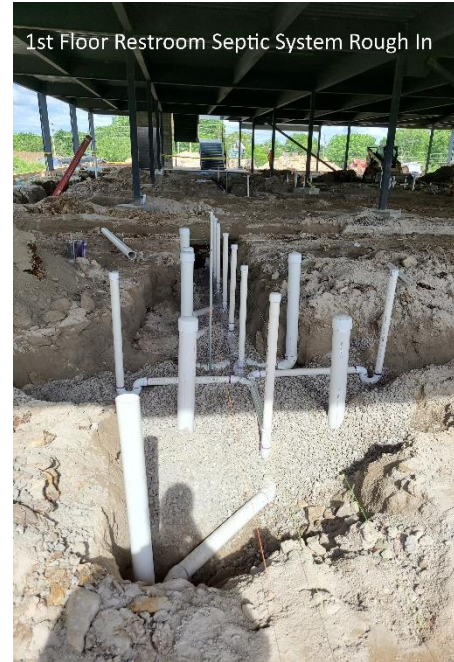
1st Floor Restroom Septic System Rough In