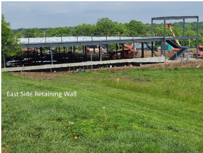
East Side Retaining Wall