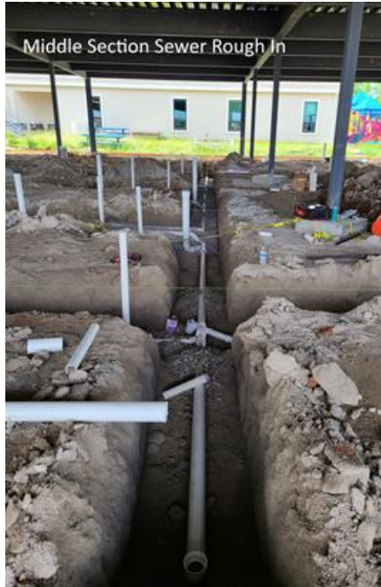
Middle Section Sewer Rough In