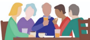
Faith Alive Group 55+

Faith Alive (55+ group) is planning to get together Sat., April 13, at 4:30p.m. in Room 114. Come join us for an evening of fun and fellowship...and, of course,