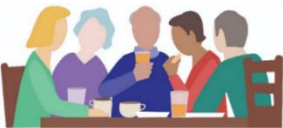
Faith Alive Group 55+

Faith Alive (55+ group) is planning to get together Sat. July 20 th at 4:30p.m. in Room 114. Come join us for an evening of fun and fellowship...and, of course, good food!