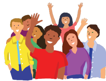
Young Adult Ministries: Welcome Back!

On Sunday August 27 th , from 3:00pm-6:00pm in the Fellowship Hall, there will be a kickoff event for Beautiful Savior Young Adult Ministries.