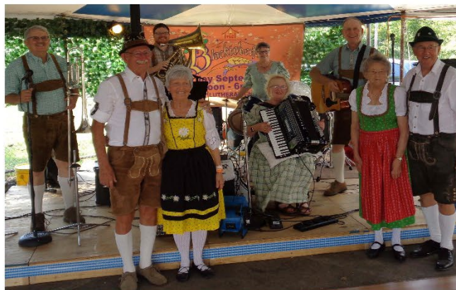
Loehnig German Band