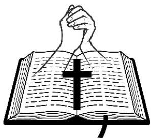
THE LORD'S PRAYER

Registration is open for the annual KS District Fall Confirmation Retreat for all Preteen and Junior Youth (5th -8th graders). This year's theme is The Lord's Prayer . The retreat will be held at Rock Springs 4H Ranch in