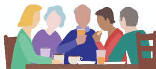
Faith Alive Group 55+

Faith Alive (55+ group) is planning to get together Sat., September 21, at 4:30p.m. in Room 114. We will start with a devotion and shared discussion. We