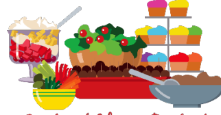
Circle of Hope Potluck

You are invited to Circle of Hope Potluck lunch Oct. 13 th after late service . This is your opportunity to discover more about Circle of Hope. We support