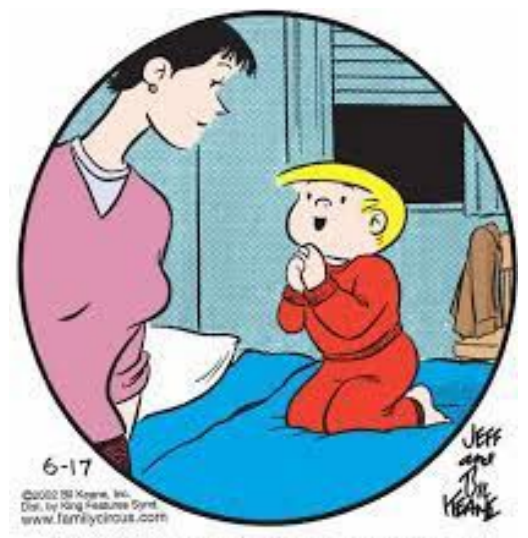
"Sayin' 'Amen' is like pressing the 'SEND' button for your prayers."