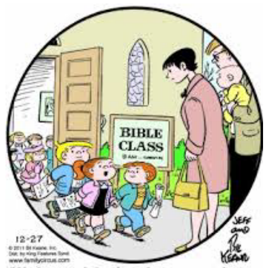
"We learned the fourth commandment: 'Humor thy father and thy mother."