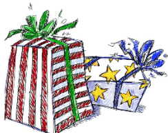
Mission Southside Christmas Store

Please help us support our local Mission Southside's Christmas Store. This is the organization that supports our Site Team ministry at the Fieldstone Apartments.