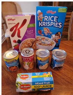
Examples of sizes of products needed

For many years, our congregation has supported the students at Pioneer Trail Middle School who participate in the Backsnack program. The program provides food items that supplement weekend meals for those students who are signed up. (According to publicschoolreview.com , 46% of the 691 students are on the free or reduced lunch assistance.) The extra food that is provided for that student on the weekends is very much appreciated by those families who may be struggling financially.