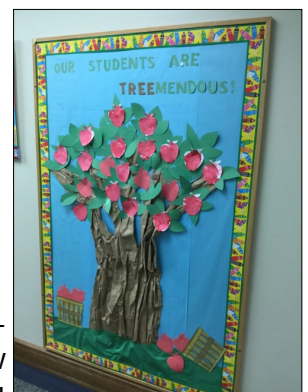
Fall MDO Art